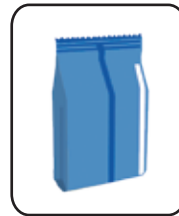
Centre Seal Gusset Pack